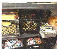
Back to School